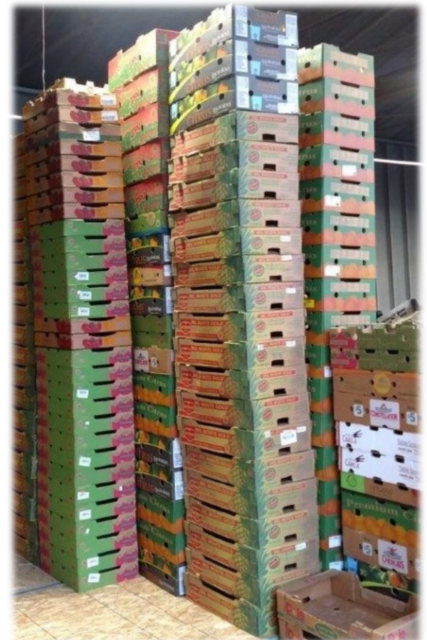
Cardboard trays saved by Safeway staff for YCMGA.