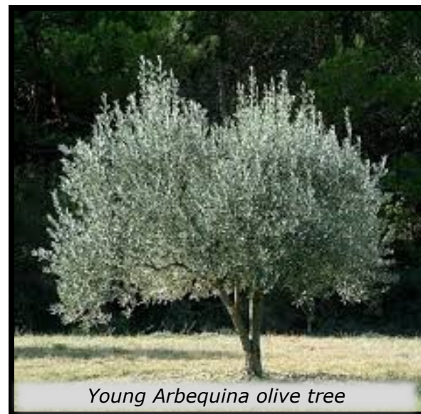
Young Arbequina olive tree

importance of getting a pH test of their soil. This is very important for olive trees, which tend to prefer a more alkaline soil than is typical in Oregon. Our soils often have a pH of 5.86.0, whereas olive trees like a pH of 7.0 or just above. In most gardens here, the addition