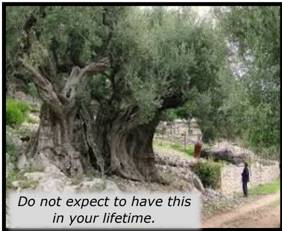
Do not expect to have this in your lifetime.